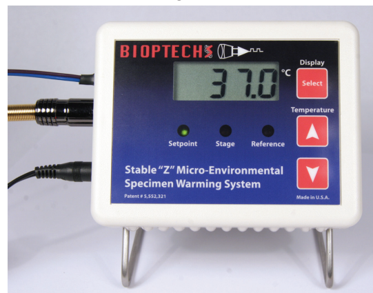
Location and description of cables