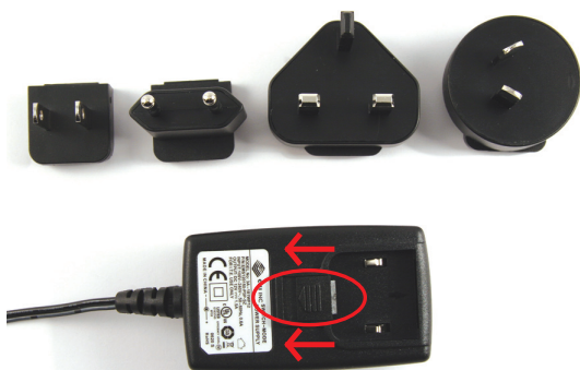
Power adapter and plug adapters