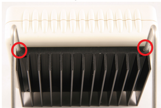
Locations to install controller stand