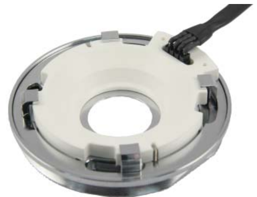
Assembled FCS2 Open Mode Adapter

The base of the FCS2 should be wiped (not immersed) with 70% ETOH (do not autoclave the metal base).